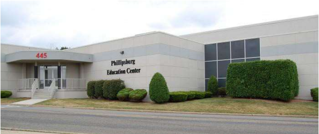
PHILLIPSBURG EDUCATION CENTER