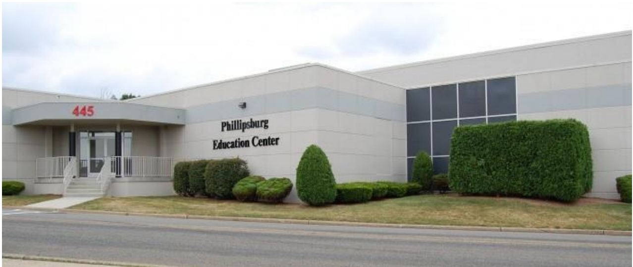
PHILLIPSBURG EDUCATION CENTER